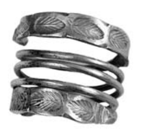
Dacian silver ring from the t<sup>st</sup> century AD, part of the hoard found at Măgura, Teleorman County

To the south there lived the Thracians. Many historians believe that the Geto-Dacians were in fact a Thracian tribe, relying on a single sentence from the Greek historian Herodotus (5<sup>th</sup> century BC). Today it seems that this is not exactly true. They may have been close relatives of the Thracians, but their languages (or what little we can make of them) were not very similar, for in the Geto-Dacian language we do not find the same place names, nor the same royal names as in Thracian, and