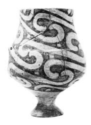
Pottery of the Cucuteni culture (4800 to 3000 BC)

If you look at a physical map of Romania, observe the shape of the Transylvanian Plateau: you could say that our country forms a great circle around Transylvania. Well, that was where the Romanian nation was born.