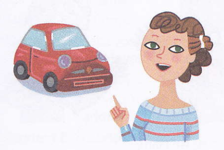
an Italian car.